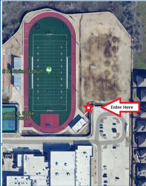
Strike Middle School 8798 Scotty's Lake Lane, The Colony, Tx 75056